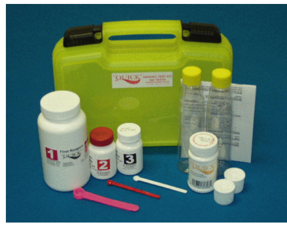
Figure 2-1. Industrial Test Systems, Inc., Quick<sup>™</sup> Arsenic Test Kit

The objective of the ETV AMS Center is to verify the performance characteristics of environmental monitoring technologies for air, water, and soil. This verification report provides results for the verification testing of the Quick<sup>TM</sup> test kit for arsenic in water. Following is a description of the test kit, based on information provided by the vendor. The information provided below was not verified in this test.