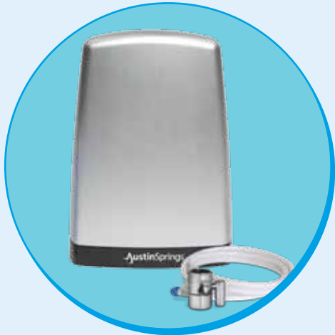
Filter unit with snap-on cover with diverter valve and hose assembly