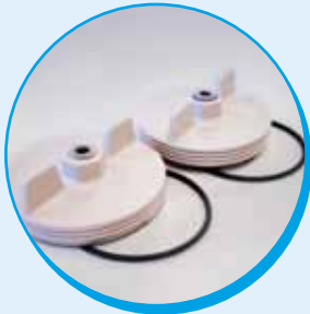
Threaded cartridge caps (A & B) and O-rings pre-installed in filter unit