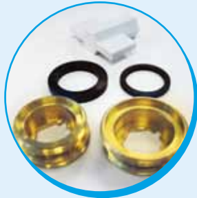
Brass faucet adapters (2 sizes), rubber washers* and install tool (*not included in the system certification)

Your filter comes pre-assembled with cartridges you won't need to change for six months.