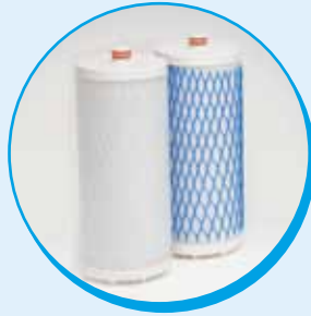
Filter cartridges (A & B) pre-installed in filter unit (Model: AS-DW-R).

Your filter comes pre-assembled with cartridges you won't need to change for six months.