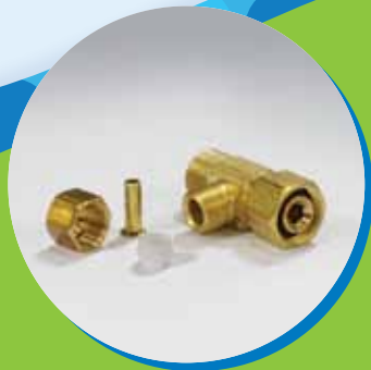
Brass faucet "T" adapter with brass insert, plastic sleeve & brass nut.