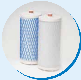
Filter cartridges (A & B) pre-installed in filter unit (Model: AS-DW-R)

The AS-DW-UC water filter system comes in three designer finishes — Chrome, Brushed Nickel and Oil-Rubbed Bronze.