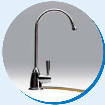
Faucet and hoses (Model: AS-DW-UC)