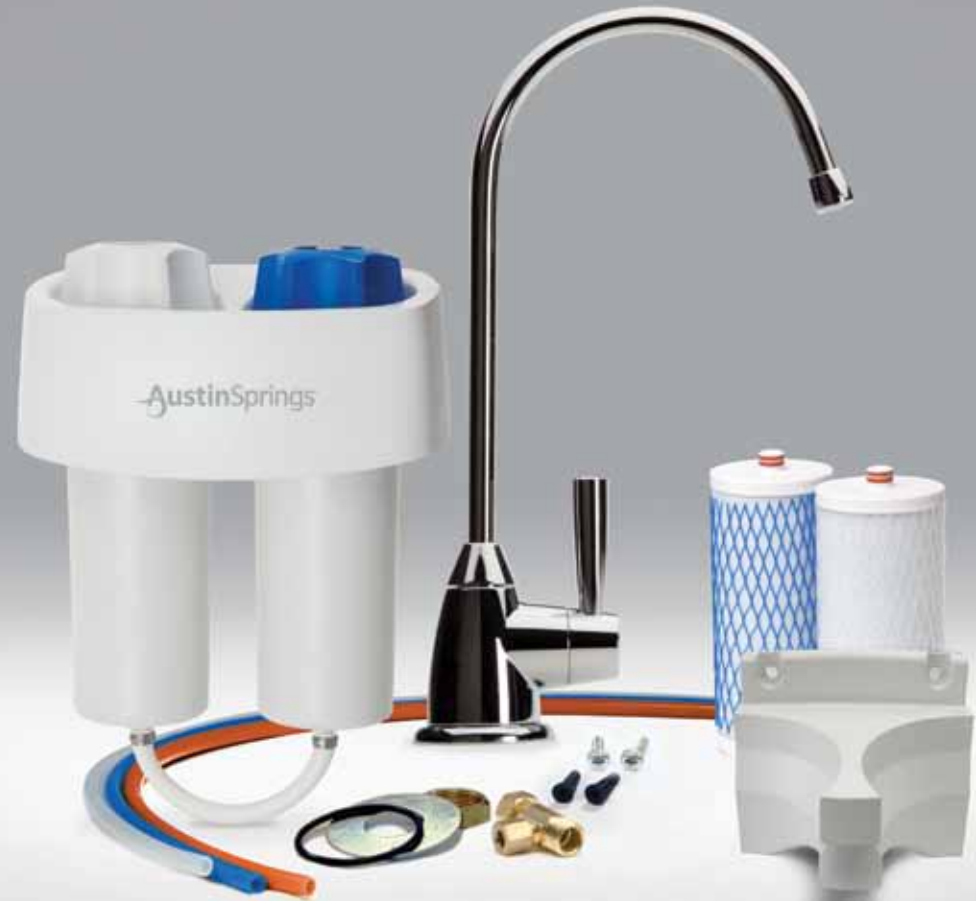
Chrome Faucet Shown

Do not use with water that is microbiologically unsafe or of unknown water quality without adequate disinfection before or after the system. Systems certified for cyst reduction may be used on disinfected waters that may contain filterable cysts.