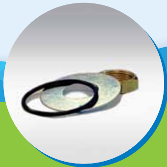
O-ring, washer and nut for faucet installation.