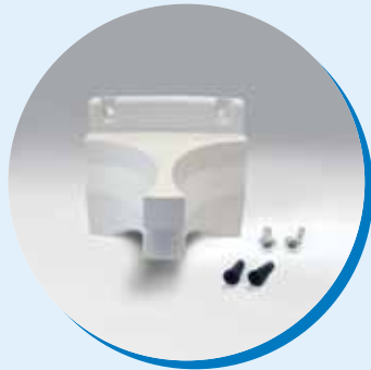
Filter Unit mounting bracket (Mounting tape and screws included)