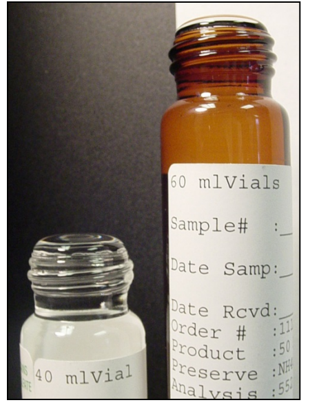
Example of "small button of water"